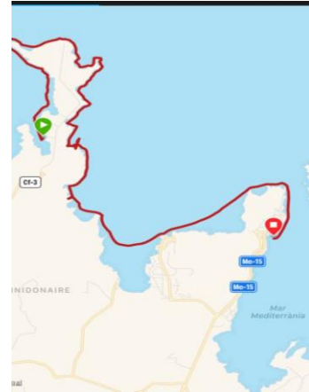
Port de Sanitja to Fornells 9.2m

the minivan to the launch point. We got away smoothly, having learnt from the previous day, but at some point on the main road to Fornells, the second following car lost contact with the Minivan, (always driven at a fair lick despite its heavy trailer loaded with our boats), and having arrived at the presumed destination the latecomers found it deserted. Bless the mobile phone which restored contact and provided the name of the place to head for and the information that there was a lighthouse nearby, and no thanks to satnav which went into meltdown, and delayed the journey further with directions through barred lanes, footpaths and housing estates, till at some point we spotted a distant lighthouse, followed our noses in that direction and eventually found old-tech signposts to get us there. Everyone else was assembled, boats unloaded and neatly lined up, and greeted us with great good humour despite the delay we caused.