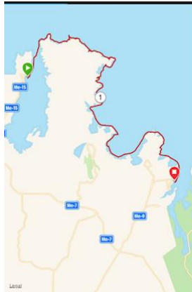
Fornells to Na Macaret 11.5m

against a rock at the foot of the cliffs, rather spoiling the view of nature at her grandest. This provoked Andrew to perform a rescue, hopping out of the back seat of the double on to an improbable, uneven, algae-coated rock, while I rocked and swayed and tried not to float away. A big wrench to free the chair, and we left with our trophy lashed on at the back, including some disgruntled shellfish tenants.