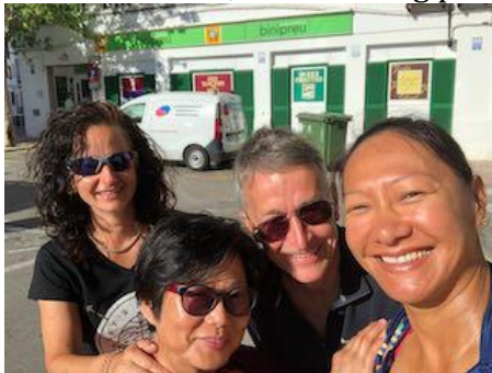
The shoppers & their chauffeur

We had mild weather all day, progressing slowly along in a mild breeze and sunshine past massive cliffs, providing few landing places but fascinating sculptured and fractured rocks, and bedding planes twisted by former