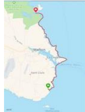
Cala d'Acaufar to Es Grau 13.5m

This day we were back on the north-east coast, starting further south to end at Es Grau (thus a different section of coast from our first day paddle). We started from Cala d'Acaufar, which provided an easy launch, unlike the long staircase at Cala Morell the previous day.